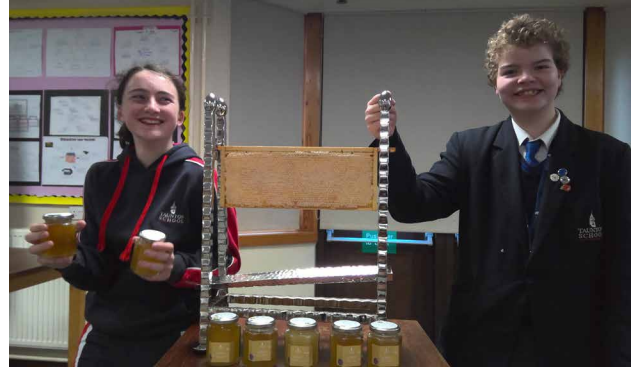
The Eco Club will be selling five of these complete honeycombs and honey in jars from a swarm that made its home at the school earlier in the term. The club has spent a number of weeks spinning the honey and preparing it ready for the TPS Christmas Fayre.