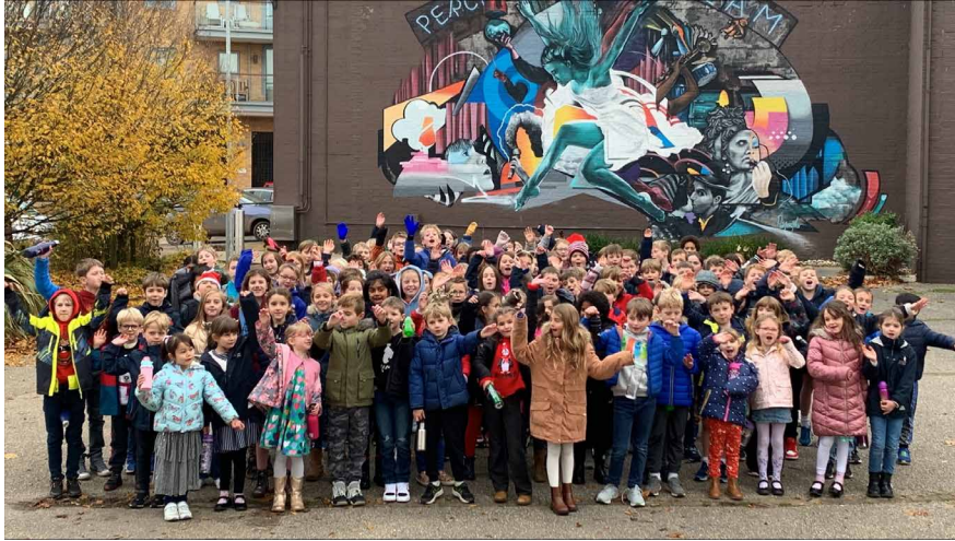
Pupils in Years 3 to 5 visited the Brewhouse Theatre to watch The Little Prince.