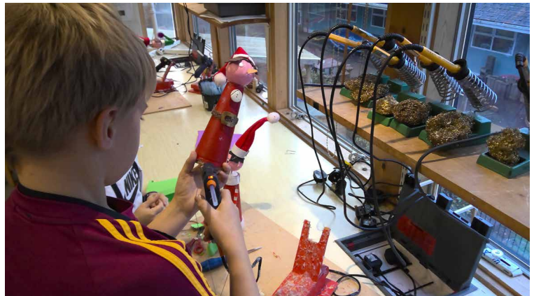
It's beginning to look a lot like Christmas with these mischievous little elves on their shelves.