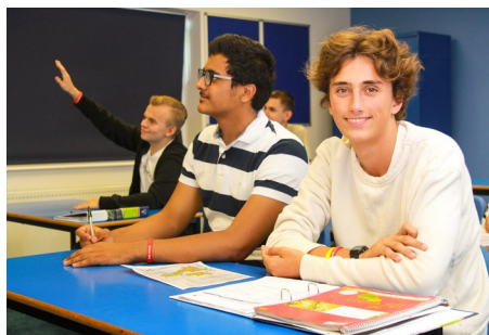
A-Level/IB or Foundation Preparation (16-17 years)