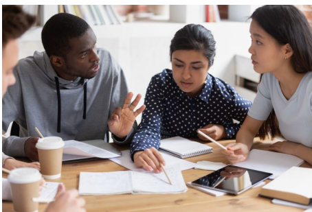
GCSE Preparation (14-15 years)